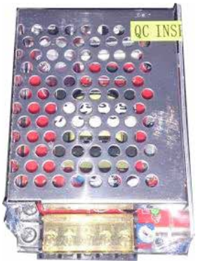
5A 12VDC Power Supply